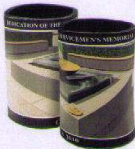
Stubby Cooler Was $7.00 - Now $3.50