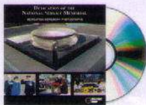
Photograph CD Was $20.00 - Now $10.00