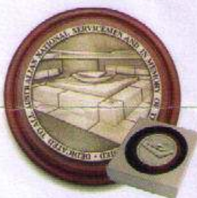
Plaque in Gift Box Was $49.00 - Now $24.50