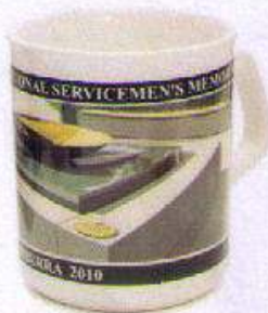
Coffee Mug Was $10.00 - Now $5.00