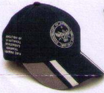
Cap Was $16.00 - Now $8.00