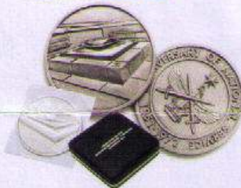
Medallion In Gift Box - Was $19.00 - Now $9.50 In Sleeve - Was $12.00 - Now $6.00