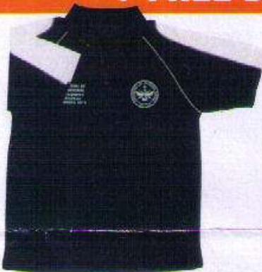
Polo Shirt Sizes S - 5XL. Was $29.00 - Now $14.50

50% OFF all National Service Memorial Memorabilia + FREE DVD with orders of $50 or more