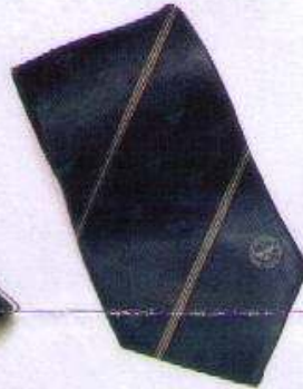
Tie Was $25.00 - Now $12.50